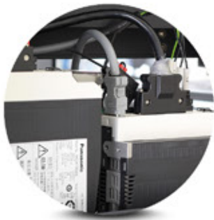
PANASONIC Servo Motor Transmission System