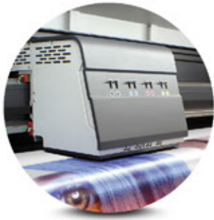
KONICA MINOLTA KM1024i 14 Picoliter Printing Head